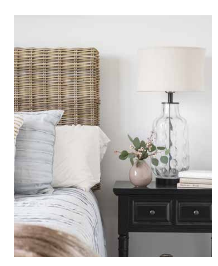
In the primary bedroom (above), a woven headboard imparts a coastal vibe. The primary bath (right) features a custom vanity designed by Engrained Design Works. A roll-in shower is clad in ceramic tile and the floor is covered in wood-look porcelain. A tall window overlooks the owners' deck with the water beyond.

The kitchen exemplifies the coastal sensibility that Pehlke and her client embraced. "Tina had just completed the kitchen in her other house, and she literally wanted to recreate it here," the designer reveals. Columbia-based Engrained Design Works devised the custom cabinetry—and all other built-ins throughout the house—while Pehlke selected details including cabinet style, quartz countertops and a decorative backsplash. She finished the shiplap walls to match the sand-toned island base and hung airy Visual Comfort light fixtures above the island and breakfast table.