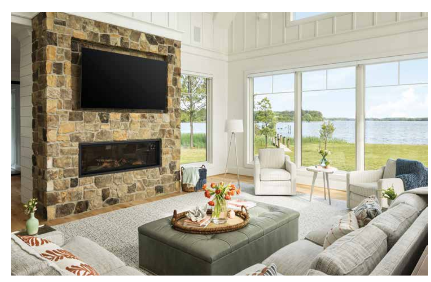
In the great room (above), a sectional sofa and coffee table/ottoman face a fireplace with a TV over it. All furniture is by Vanguard, including armchairs that swivel to take in the views. A glass wall and barn doors flood Tina's office (below) with light. A white-on-white palette in the owners' suite (opposite) ensures the panorama makes a statement; plush Vanguard loveseats and a matching ottoman occupy a cozy bay.