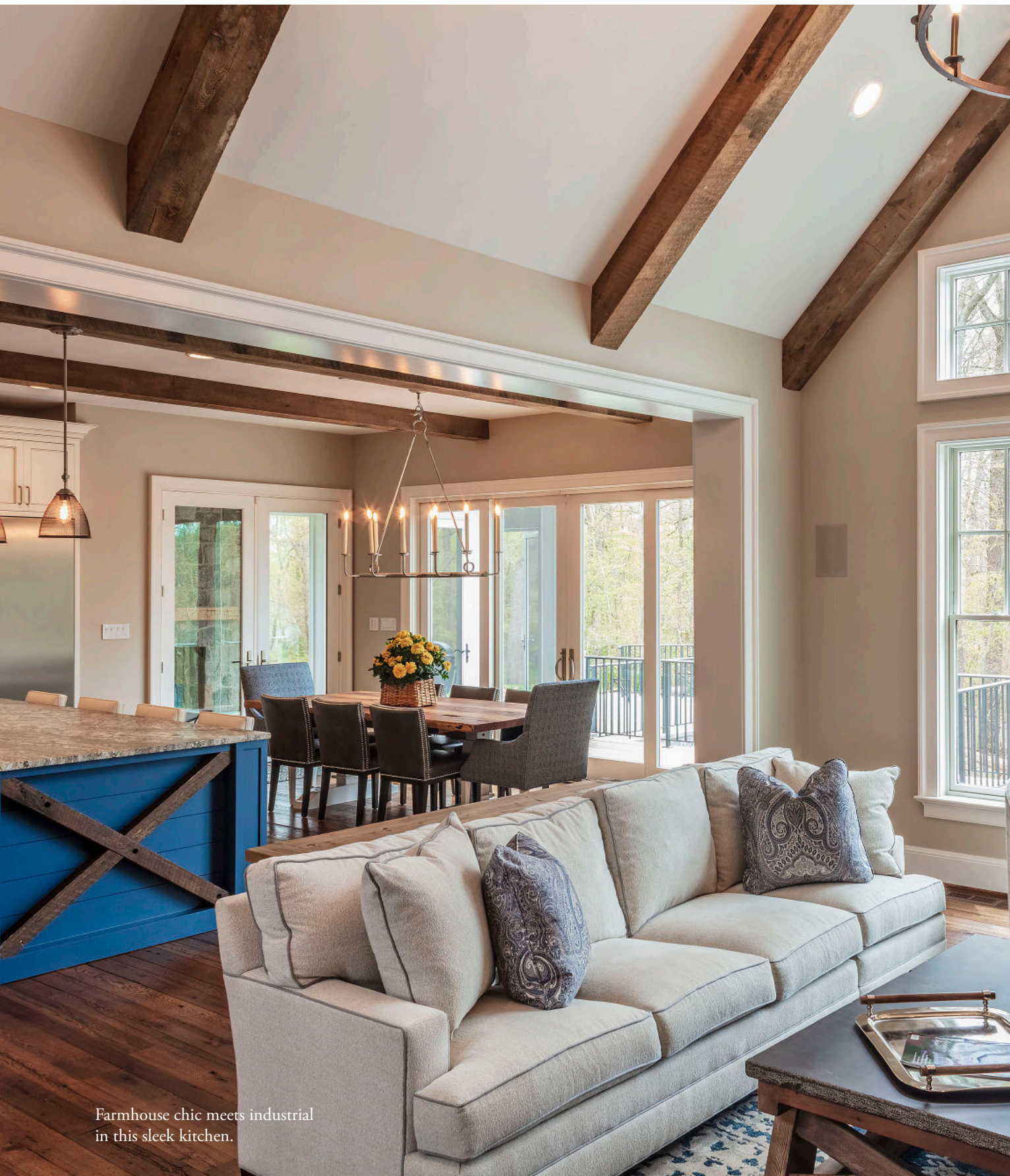
Farmhouse chic meets industrial in this sleek kitchen.